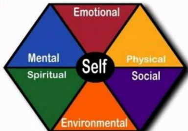
Dimensions of Health