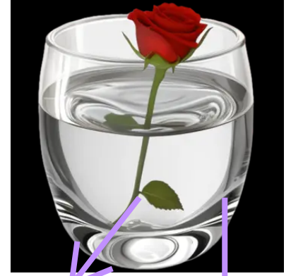
الوردة = spinal cord

Polymerase chain reaction (PCR) has become the single most important method for diagnosing CNS viral infections